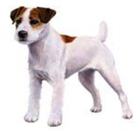
Parson Russell Terrier